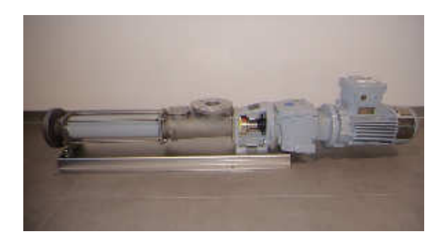
DN Pump The DN pump with high quality cartridge seal system. Seal system engineered for the Diamond series has the fundamental advantage of being quick to replace and easy to maintain.